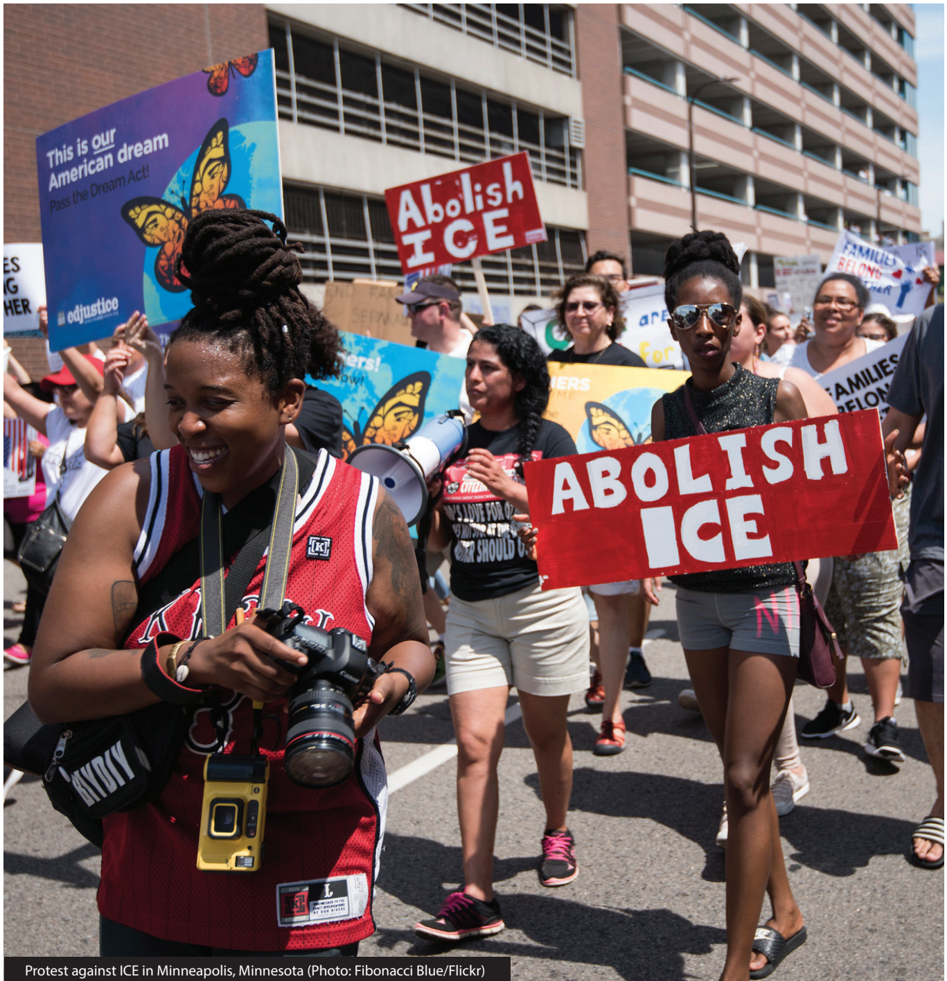
Protest against ICE in Minneapolis, Minnesota

Where would you situate us, in our current moment, in terms of the trajectory of the escalating authoritarianism that we have been experiencing? How does this compare to some of the historical scenarios you analyze in the report and what does that mean for our strategic organizing?