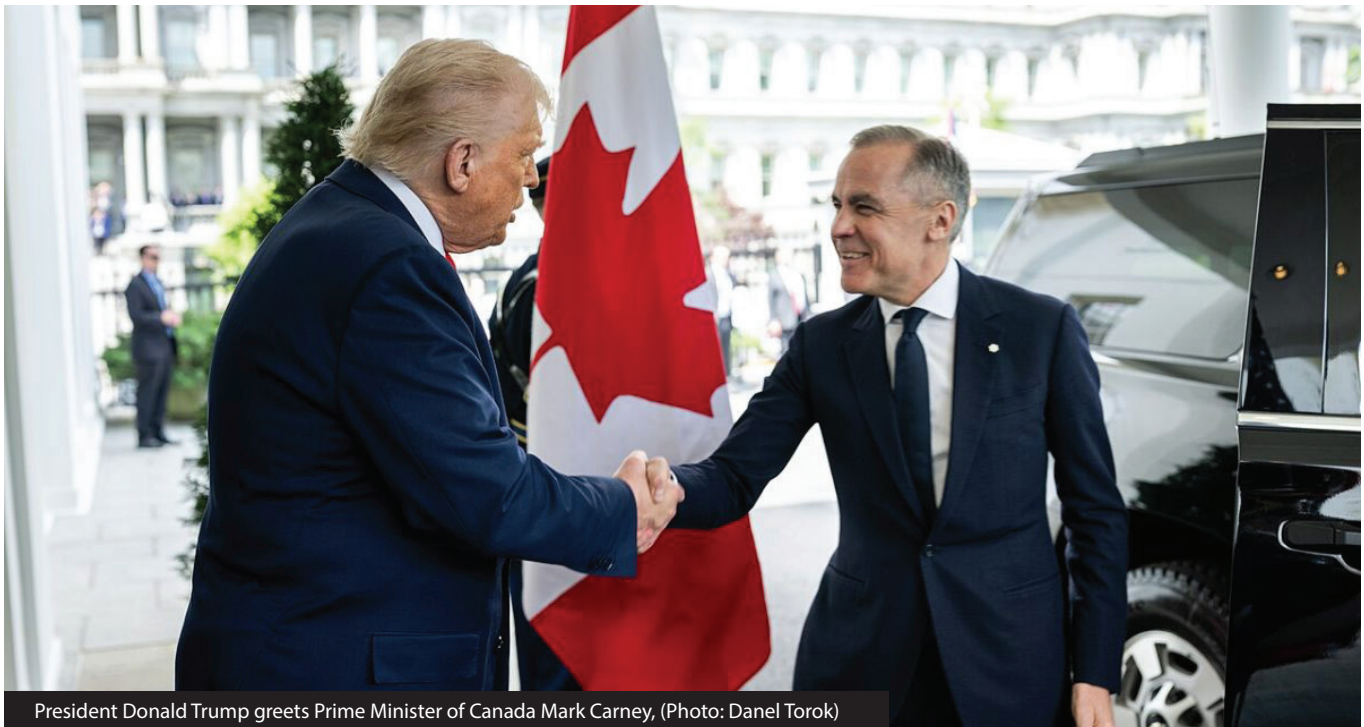
President Donald Trump greets Prime Minister of Canada Mark Carney, (Photo: Danel Torok)

fronting its closest ally. Canada criticizes outcomes while refusing to challenge the very system that produces them. This is simply appeasement dressed up as diplomacy. While statements are issued, the systems that produce these horrors remain untouched, leaving ordinary people, Palestinians, Venezuelans, Iranians, and now Cubans, to bear the consequences.