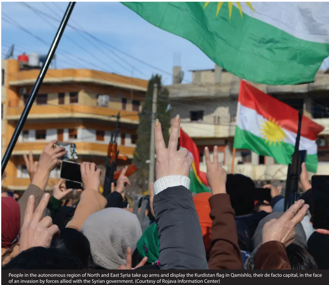
People in the autonomous region of North and East Syria take up arms and display the Kurdistan flag in Qamishlo, their de facto capital, in the face of an invasion by forces allied with the Syrian government.

hoods of Aleppo, which had been closed on 30 December 2025 due to fuel shortages and an ongoing blockade, would reopen on 4 January 2026.