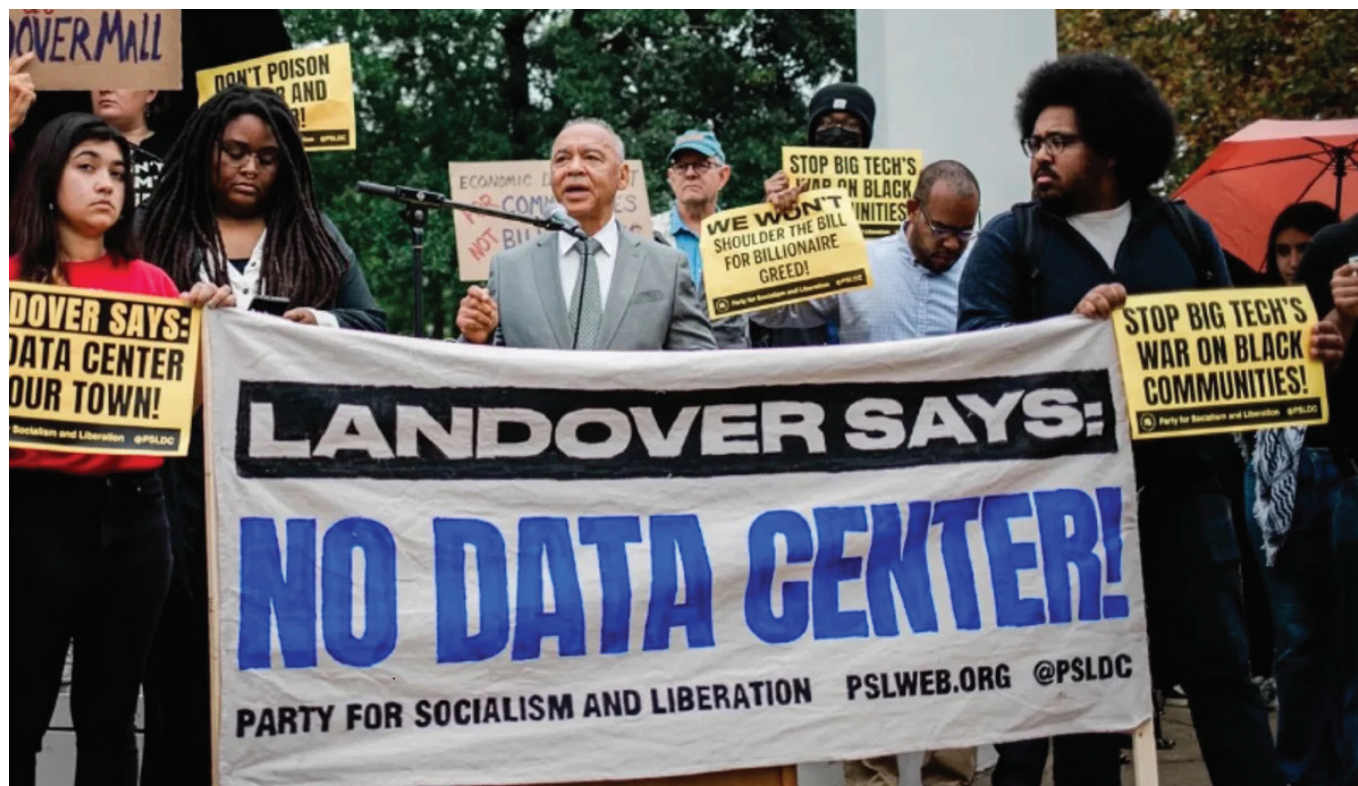
Community members in Prince George's County, Maryland, gather for a rally in September that led to a moratorium on data centers being built there.

September 18th, the House of Representatives passed a bill backed by Microsoft, Micron, and OpenAI to fast-track data centers. The bill significantly reduces the number of environmental and financial factors that can be considered in permitting processes. It's simple. These communities are becoming the Camp Lejeunes of a new age: the new toxic waste dumps in the belly of the beast used to power the war machine. They must be fought against at all costs.