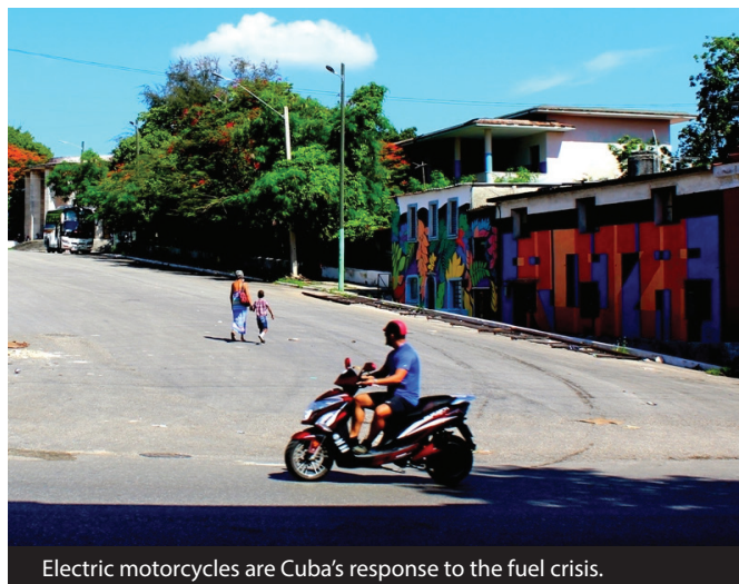
Electric motorcycles are Cuba's response to the fuel crisis.

At one feeding center, an elderly volunteer told us he spends hours every day scavenging for firewood. He proudly showed us a chunk of a wooden pallet, nails and all. "This guarantees tomorrow's meal," he said—his face caught between pride and sorrow.