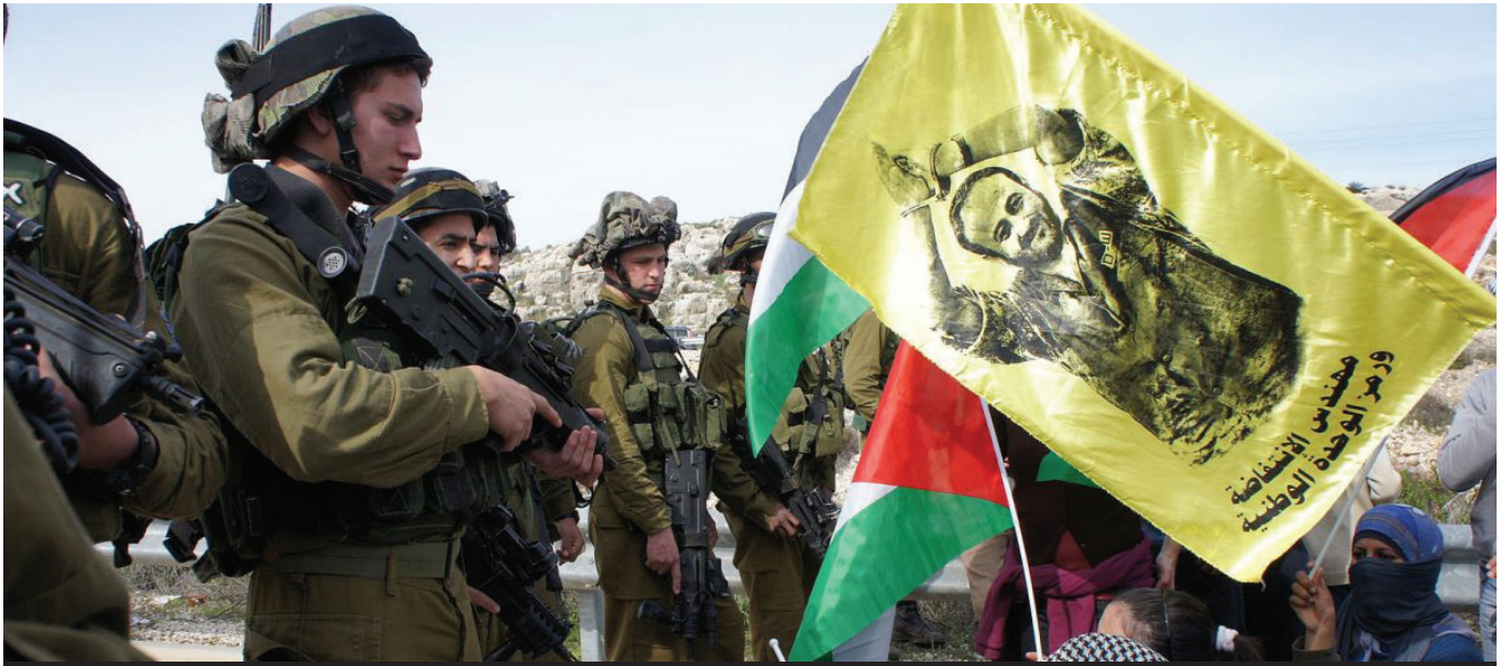
A flag with an image of Marwan Barghouti at a protest against Israeli theft of land, Kufr ad-Deek, Palestine

By allowing this Israeli “exception” to stand unchallenged, the international community has effectively sanctioned the demolition of its own legal foundations.